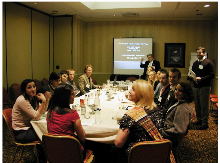
Open Student Forum Fireside Chat