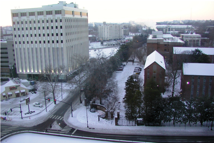
Picture was taken from the Loews Vanderbilt Hotel looking out across the street at the campus of Vanderbilt University.

On Friday January 29, 2010, 3-4 inches of snow descended on Nashville resulting in chaos on the roads, closure of schools, cancellation of buses, and airport cancellations. I would like to thank the organizing committee of the Academy for making us Canadians feel right at home. Despite the wintry start, the meeting proceeded without a glitch. People were able to get to the meeting and home with very little disruptions. The Lowes hotel staff were very helpful and hospitable to the Academy registrants and guests. The accommodation and meals were first rate. There was also plenty of time during the breaks and lunches to network and meet people from all over the world.